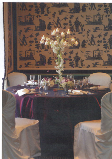
BOTTOM RIGHT PHOTO LOCATION: The Ritz-Carlton FLORAL DESIGN BY: Anat Design LINENS & SEAT COVERS BY: Tenue de Soirée