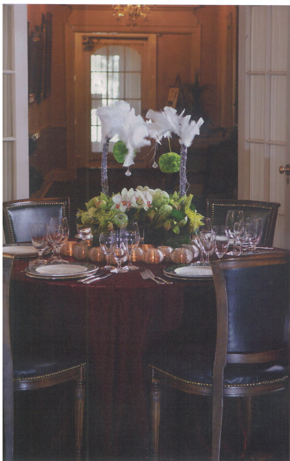
LEFT PHOTO LOCATION: Mount Stephen Club FLORAL DESIGN BY: Alain Simon Fleurs